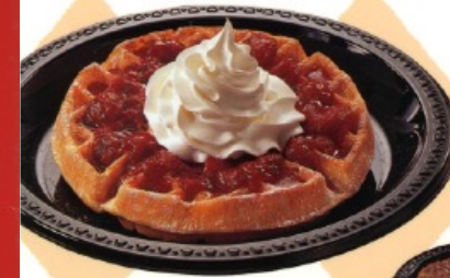
BELGIAN WAFFLE WITH TOPPING