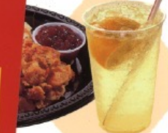
STATE FAIR LEMONADE