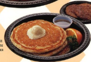
PANCAKES & SAUSAGE SIDE ORDER